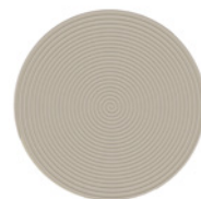
07 AVERY RUG CM Ø 400